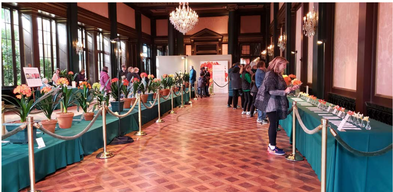
The 2019 Longwood Show Floor

Photographs of all the top entries from the show, courtesy of Marc Hamel, are on the following page. (Due to the lighting in the show area, the pictures are slightly off color.) More photos and descriptions of other placing entires may be found on the landing page of the NACS website at http://www.northamericancliviasociety.org/index.php . To access these photos, scroll halfway down beyond the photos of the top entries from The Huntington Show.