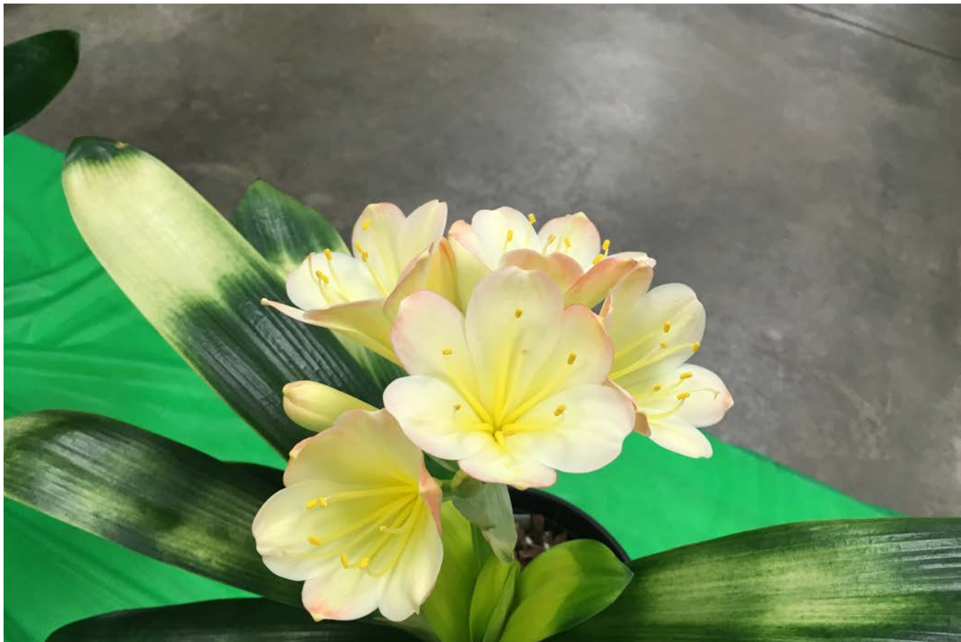
Variegated Blush (below)