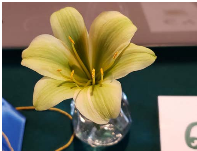
Right: Best in Flowering Division: Umbels - (no name provided) - Entered by Longwood Gardens