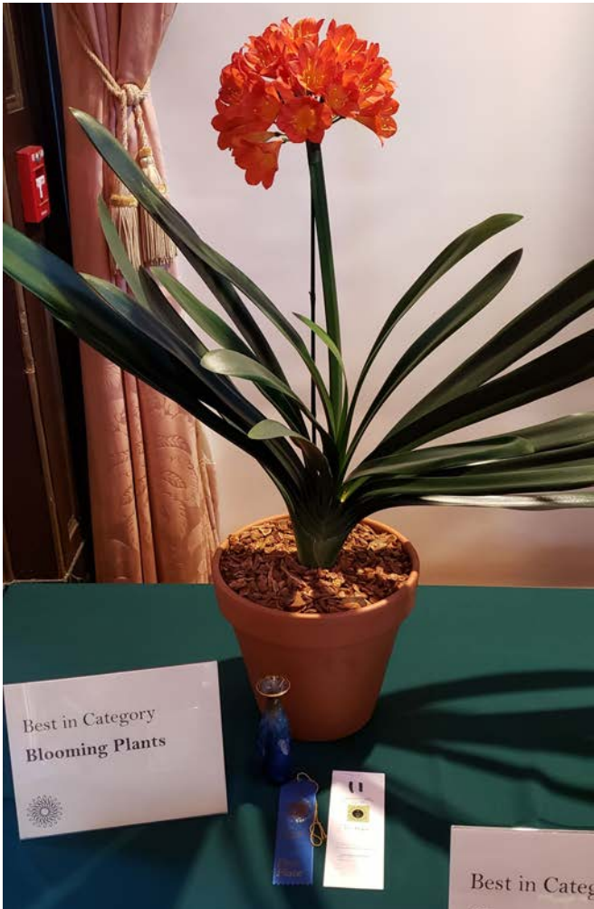
Below: Best in Flowering Division: Blooms - 'Hirao' - Entered by Longwood Gardens