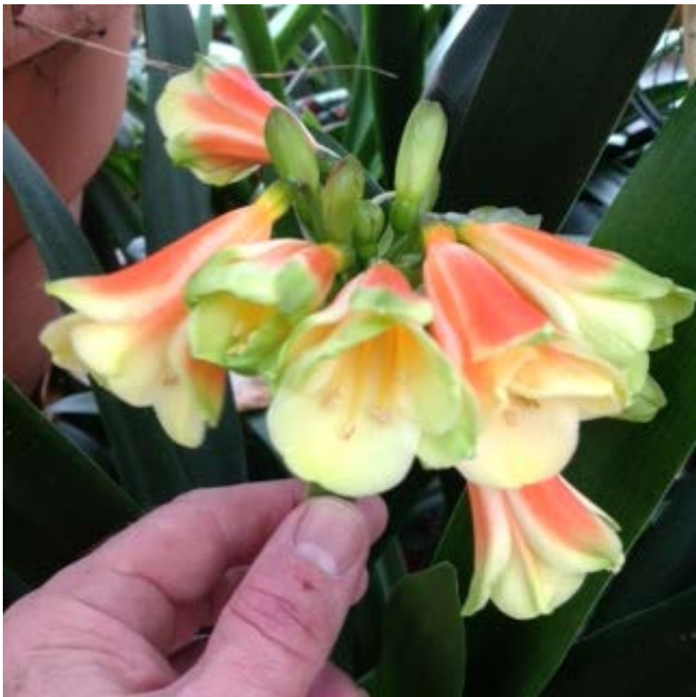
Interspecific with Green Tips (above) and Another Variegated with Attractive Flowers (below)