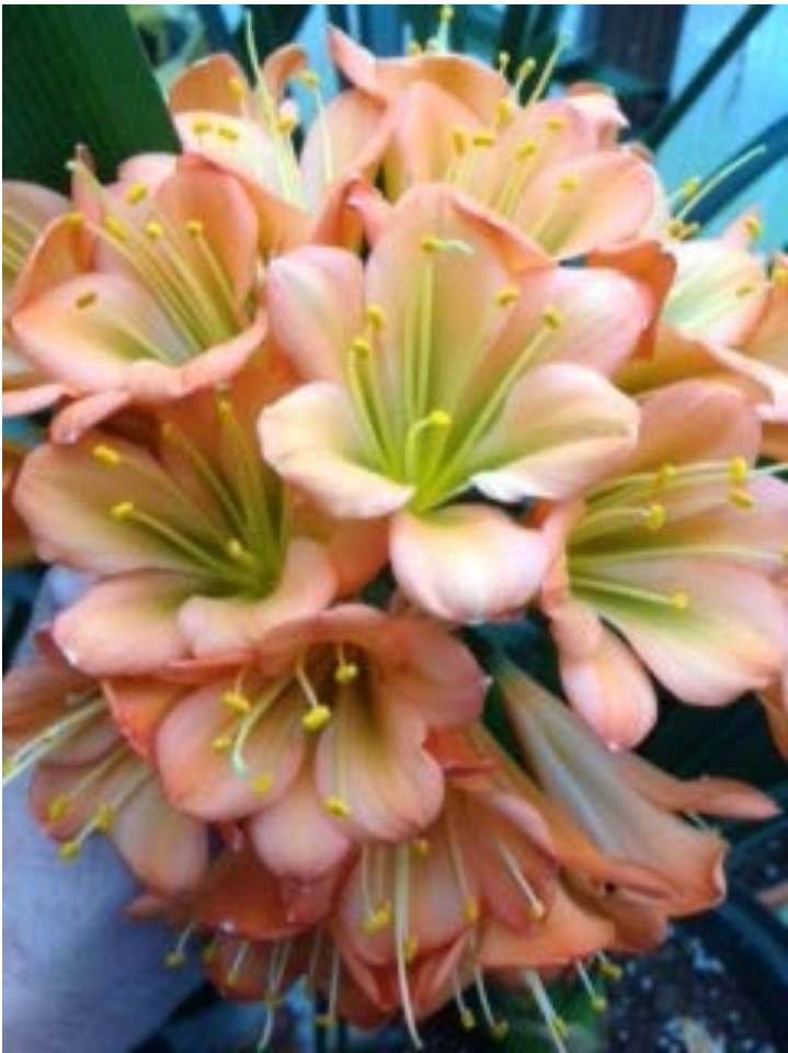
TKO x 'Helliboris' (above)