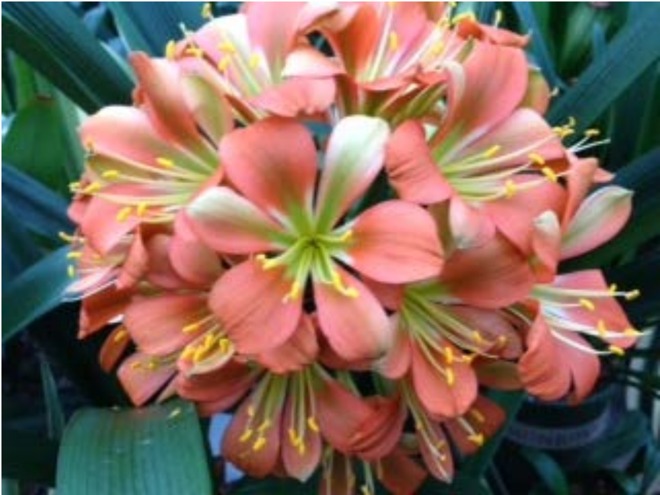
Unusual Coloration (above) and an Attractive Variegated Cream (below)